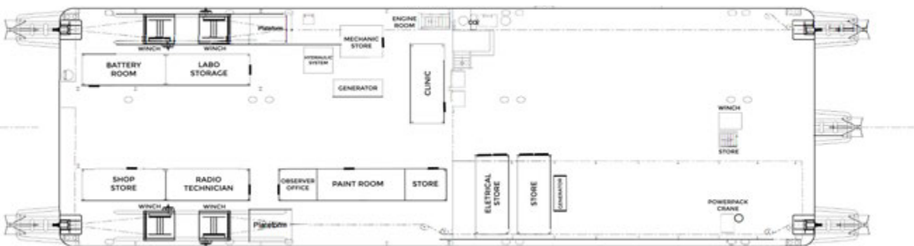
MAIN DECK LEVEL