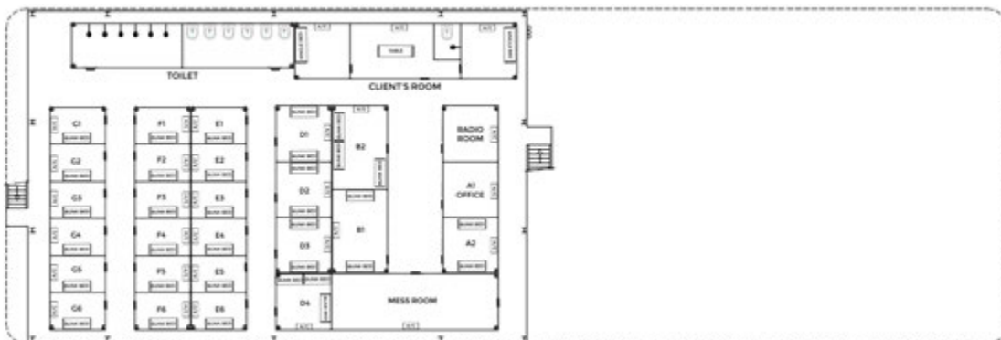
SECOND DECK LEVEL